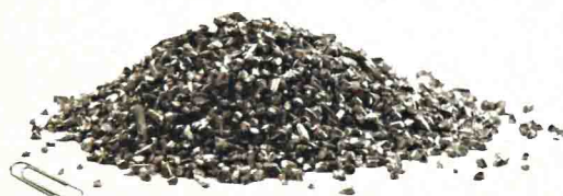
鋁顆粒 Aluminium granulate