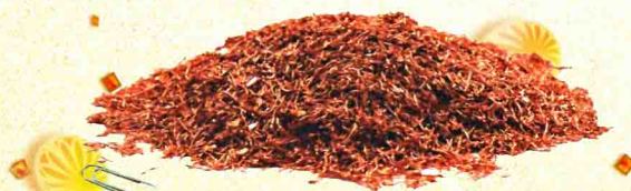
銅顆粒 Copper granulate