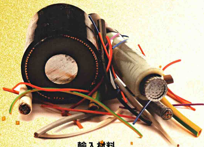
輸入材料 Input material

We also have plants for processing of greasy or greasy underground cables and jelly filled cables.