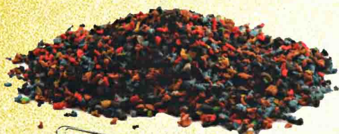
有機體/絕緣材料 Organic / insulation granulate