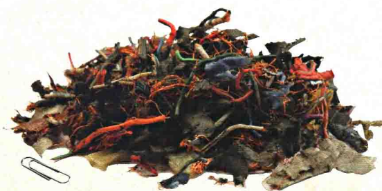
減少材料尺寸 Downsized material