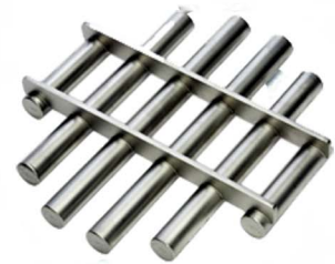
P Grate P型格柵