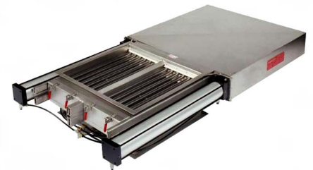
Easy-To-Clean Retractable Grate