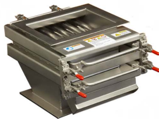
Easy-To-Clean TGH-2 Grate-In-Housing