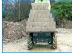
FLATBED - For breeze blocks and cement bags