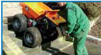
Flotation wheels for soft grounds