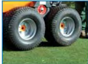
FLOTATIONS WHEELS - For soft ground