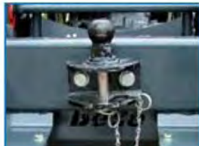
TOWING HITCH BALL AND EYE OPTION Capable of towing large trailers