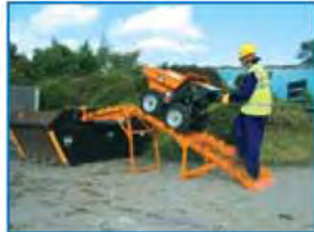
RAMPS - Foldable & easily transportable ramp