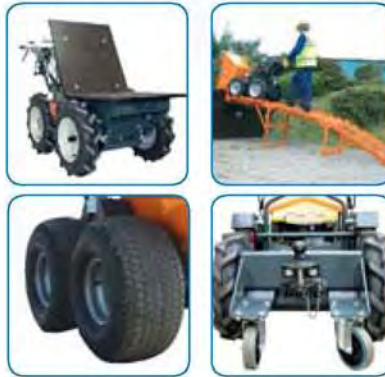
Minidumper BMD Options

The MiniDumper options increase the versatility of the machine enabling it to carry awkward or oversized loads and for tipping into skips.