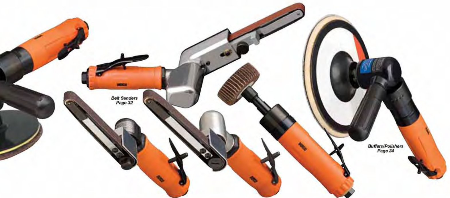
Belt Sanders Page 32

A wide range of industrial-quality PSA and hook and loop pads available in 3", 5" and 6" sizes