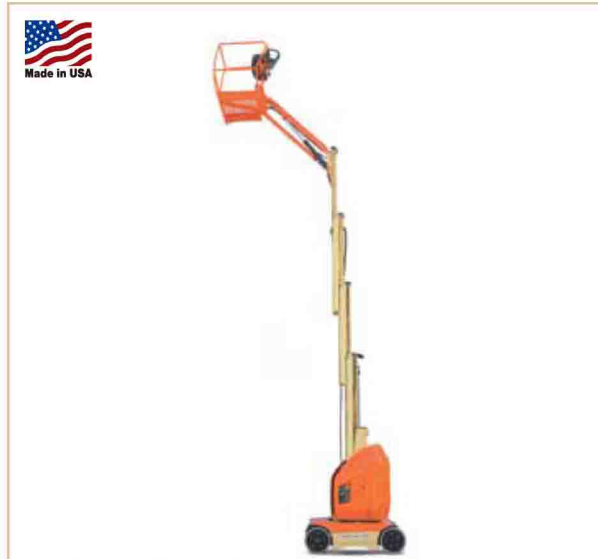
MLJ26EX 防爆型桅杆升降平台 MLJ26EX EXPLOSION PROOF MAST LIFT