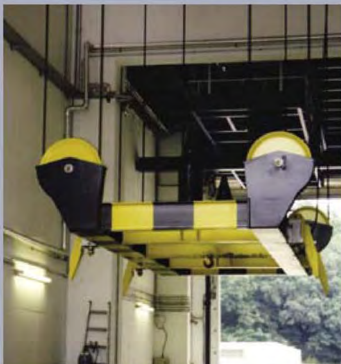
Container spreaders with central bolting