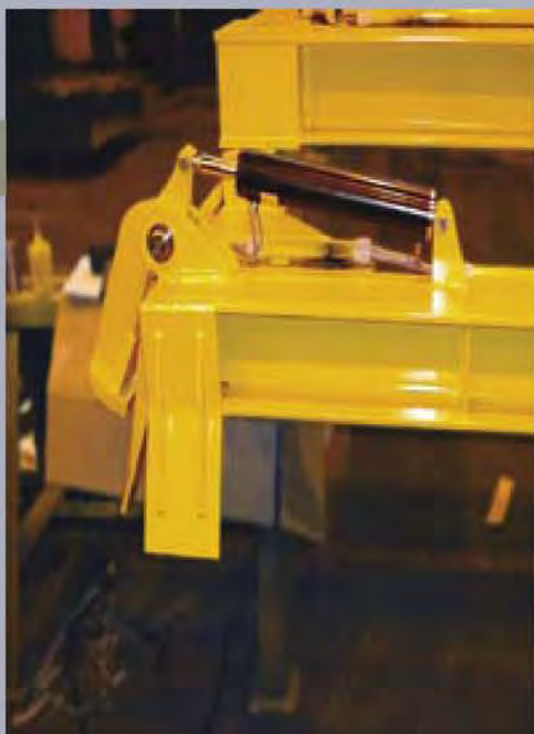
Container spreaders with BFD adapters