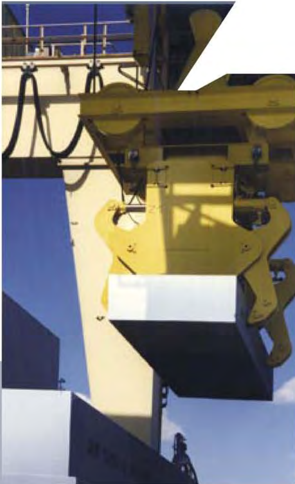
Electrohydraulic double block tongs for aluminium blocks, designed with electromotive slewing gear and pulley attachment