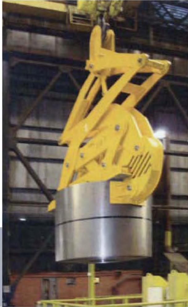
Single vertical coil tongs, mechanical design