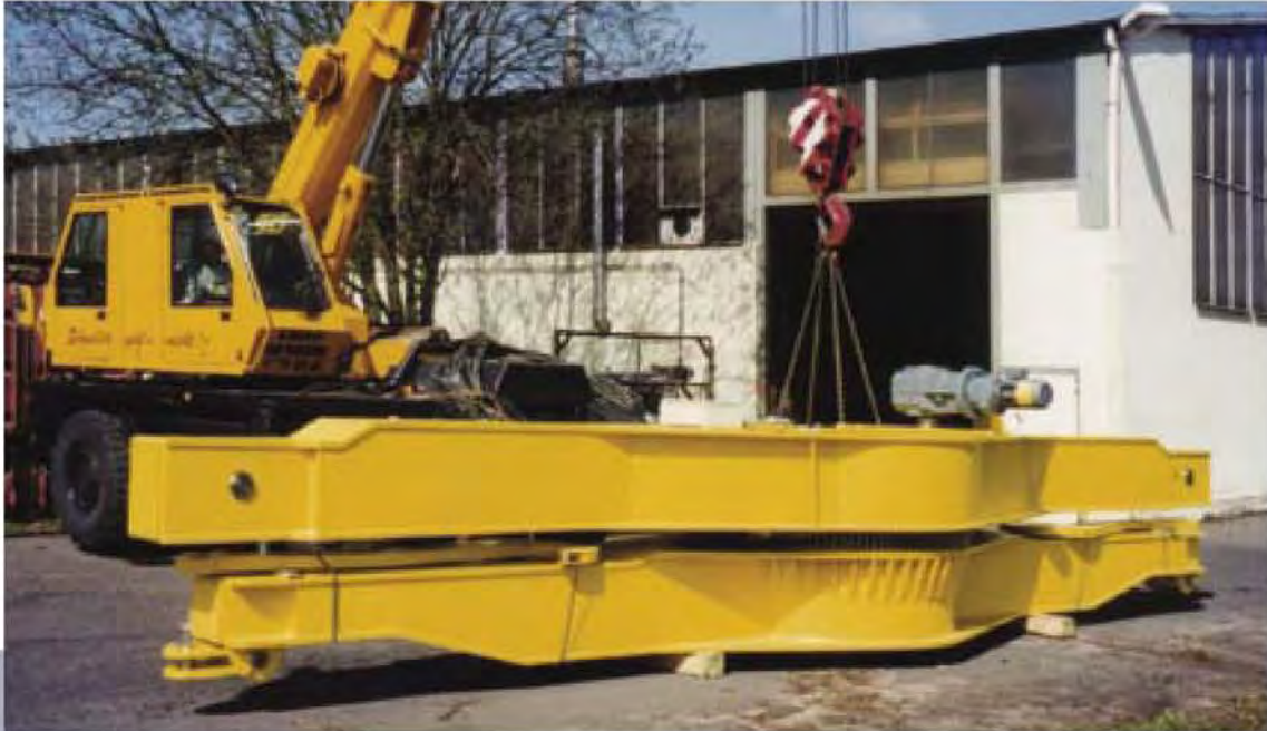
Tambur crossheads with electric slewing gear (shown without hook)