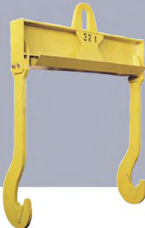
Mechanical long hook crossheads