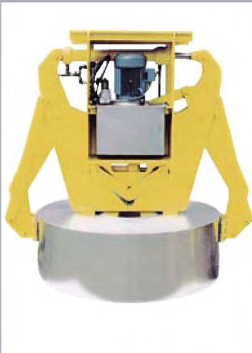
Double vertical coil tongs, hydraulic design