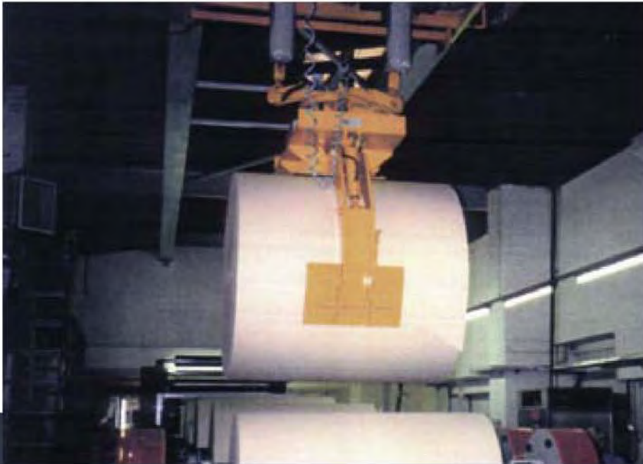
Paper Roll Tongs 紙捲夾具 Mechanical, Electrical, Hydraulic