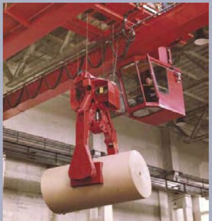
Electrohydraulic paper roll grabs with 90 degree slewing gear Mechanical long hook crosshead