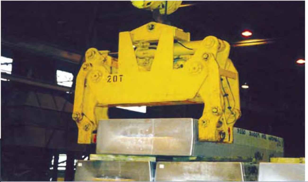
Slab Tongs 鋁胚