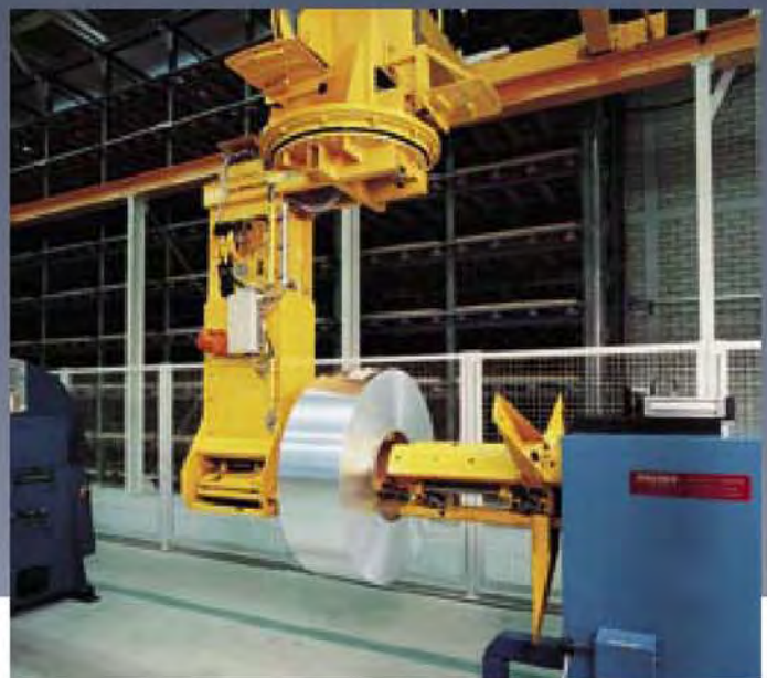
Coil Tongs, 鋁捲夾具 Horizontal / Vertical