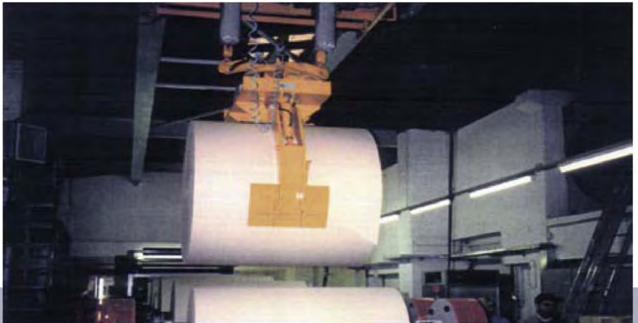
Electrohydraulic paper roll tongs with slewing gear