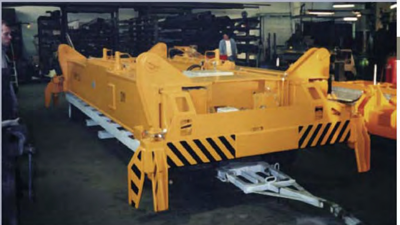
Electrohydraulic container spreaders for 20' ISO containers and interchangeable bodies