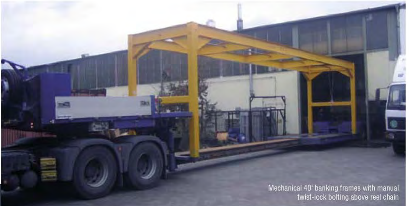
Mechanical 40' banking frames with manual twist-lock bolting above reel chain