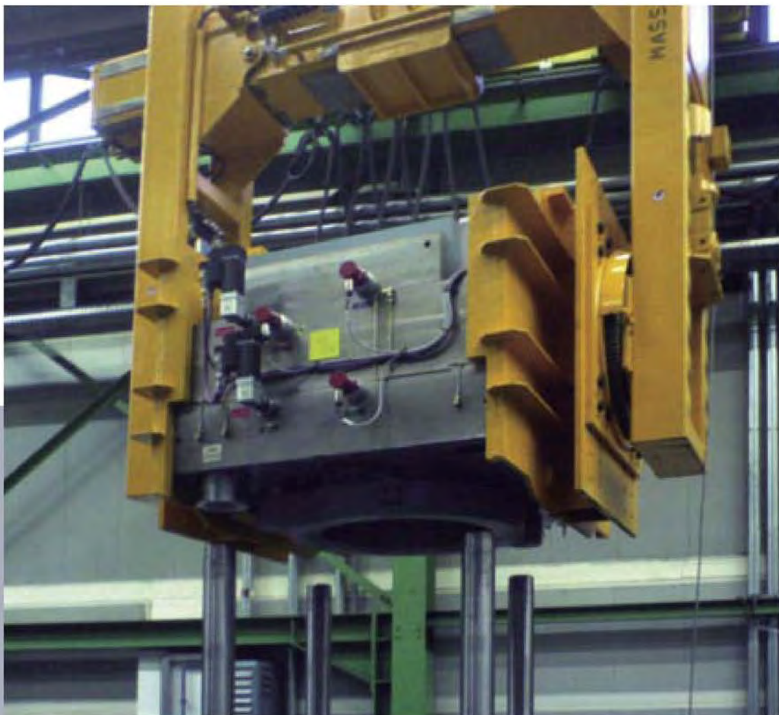
Electromotive tool stripping equipment to rotate press tools