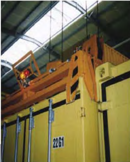
Electrohydraulic container spreaders for 20' ISO containers and interchangeable bodies