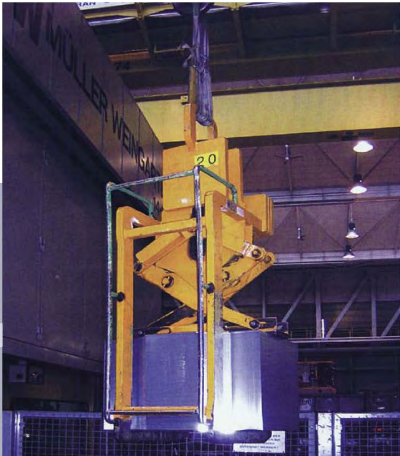
Board lifts with mechanical hold-down function