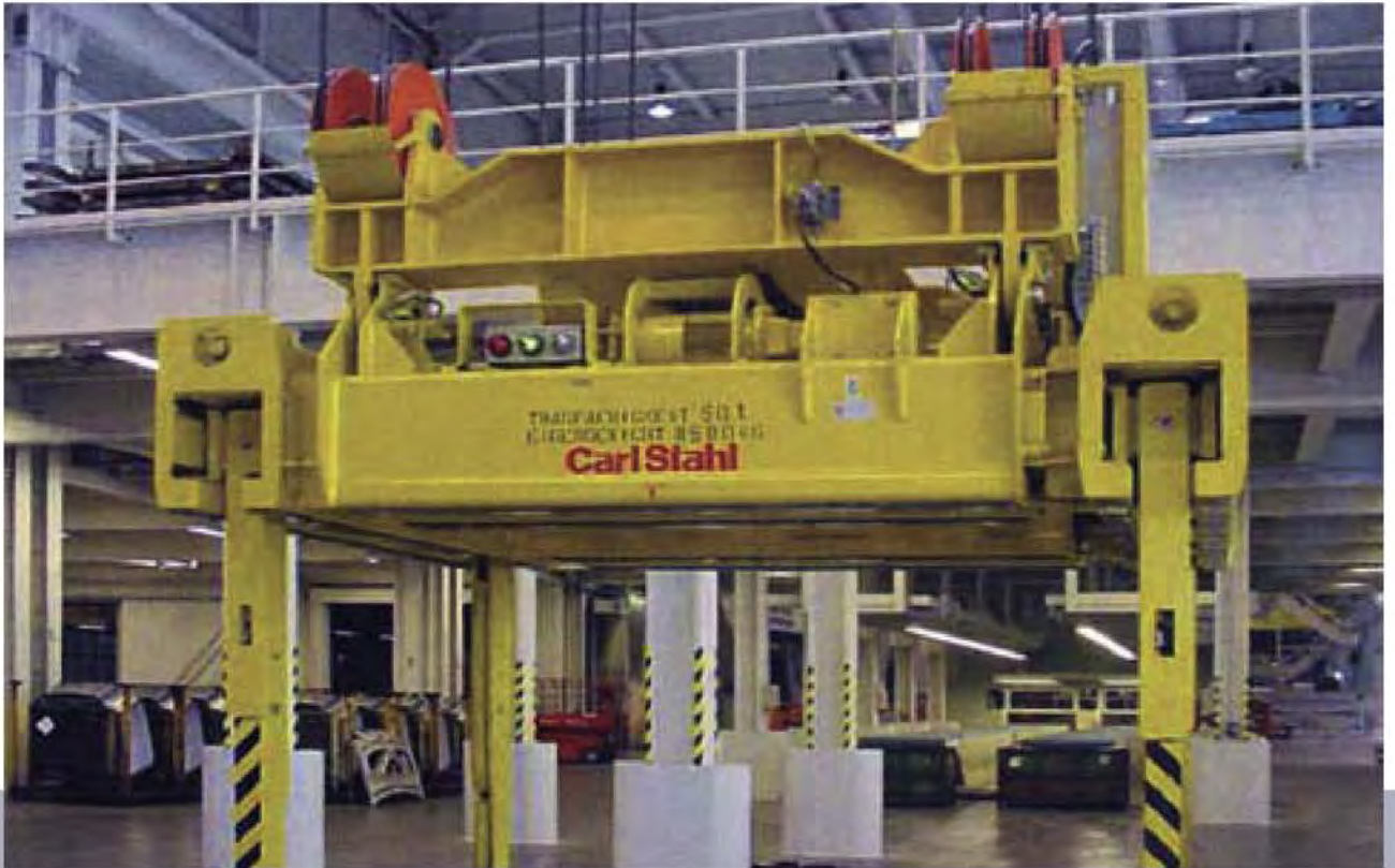
Electromotive tool grabs for the car industry