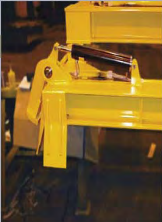
Container spreaders with BFD adapters