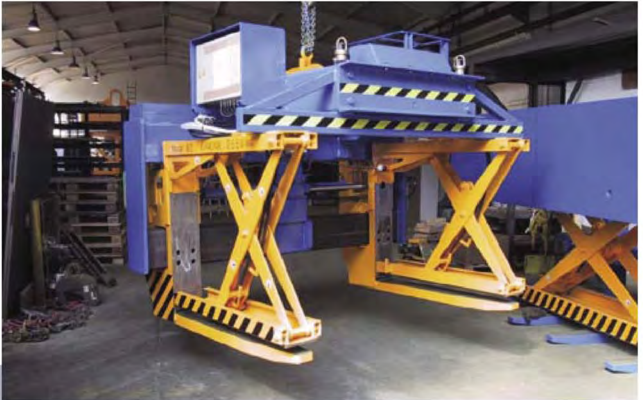
Electrohydraulic board lifts with hold-down function and grab width adjustment