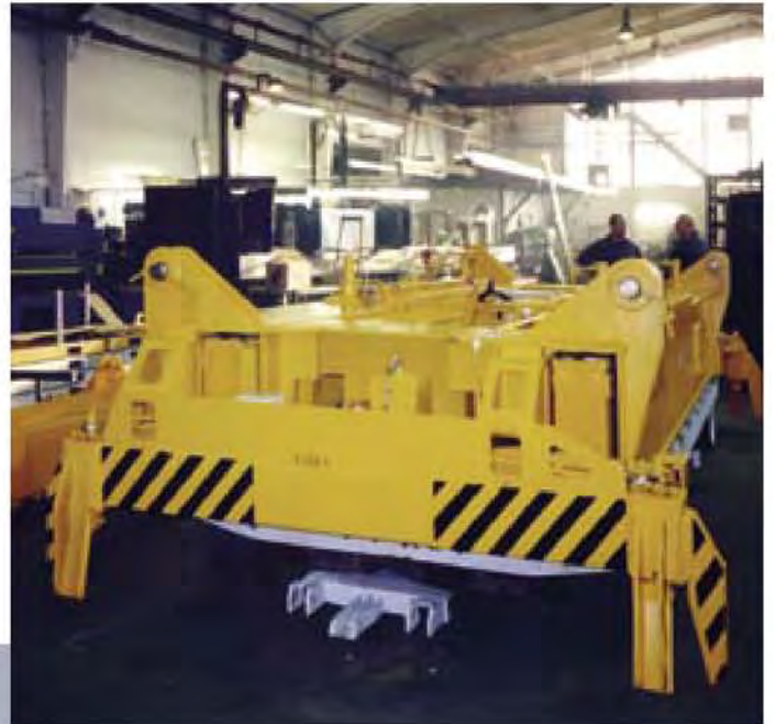
Container spreaders electrohydraulically telescopic from 20' to 40'