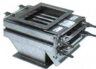
Easy-To-Clean TGH-2 Grate-In-Housing