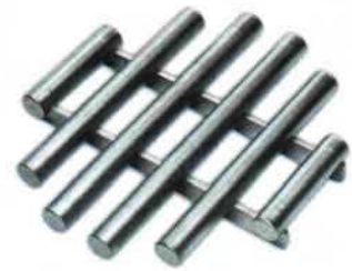
P Grate P型格柵