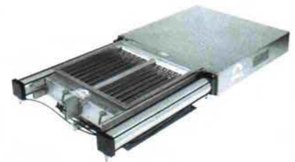
Easy-To-Clean Retractable Grate