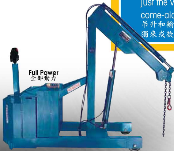
Full Power 全部動力