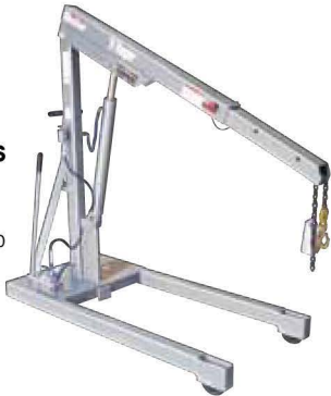
全部為不銹鋼型 All Stainless Steel