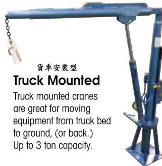
貨車安裝型 Truck Mounted

Truck mounted cranes are great for moving equipment from truck bed to ground, (or back.) Up to 3 ton capacity.