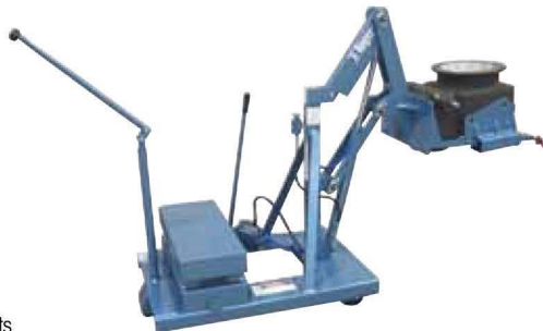
選用可包括 Options available include:

Designed to meet complex requirements demanded by the pharmaceutical industry along with the maximum ergonomic benefits of a lift table.