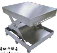
不銹鋼升降桌 Stainless Steel Lift Tables

Got a special material handling challenge? Give us a call to design and manufacture a unit to your unique requirements.