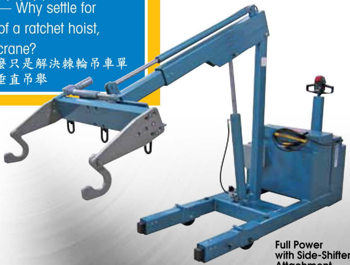
Full Power with Side-Shifter Attachment 全部動力附有旁移配件