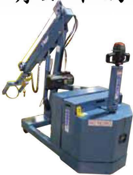
全部動力客戶型 Full Power Custom