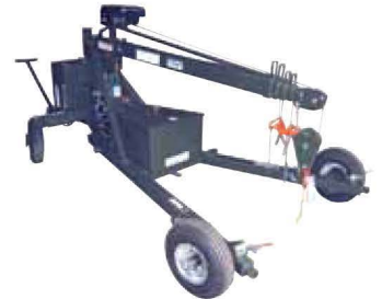
可托動Ruger型 Towable Ruger