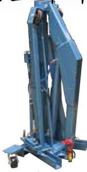
折疊型 Fold-Up Ruger