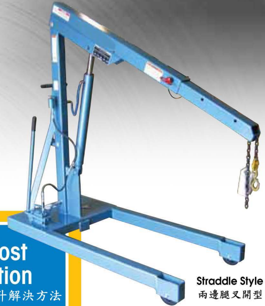
Straddle Style 兩邊腿叉開型