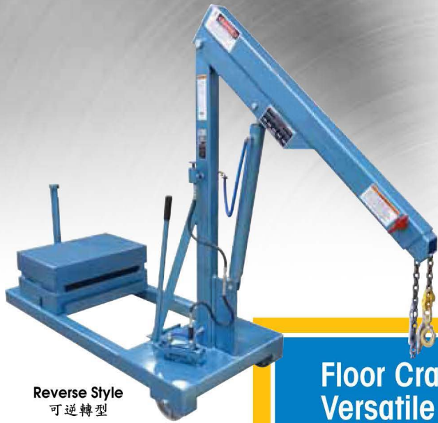
Reverse Style 可逆轉型