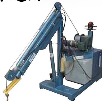
全動力Ruger型 Full Power Ruger