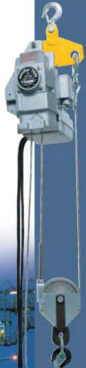
Minifor® TR10 - TR30 fitted with sheaving kit