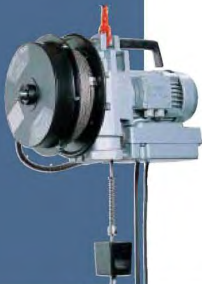
Minifor® fitted with wire rope reeler