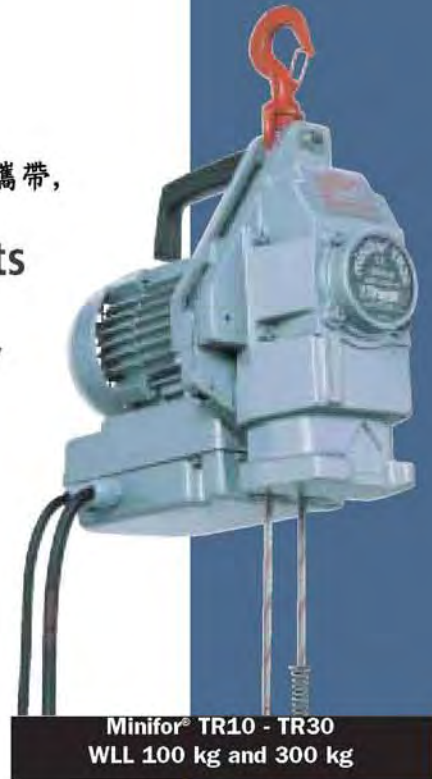
Minifor® TR10 - TR30 WLL 100 kg and 300 kg