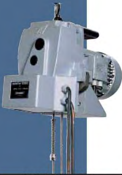
Minifor® TR30S - TR50 WLL 300 kg and 500 kg