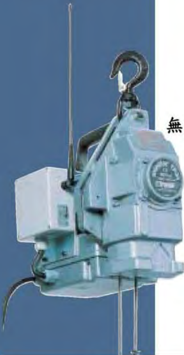
Minifor® with radio controls